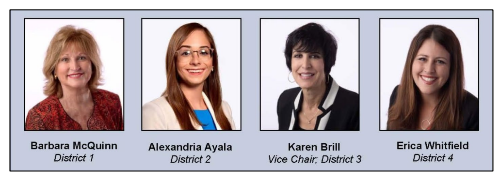
The School District of Palm Beach County School Board